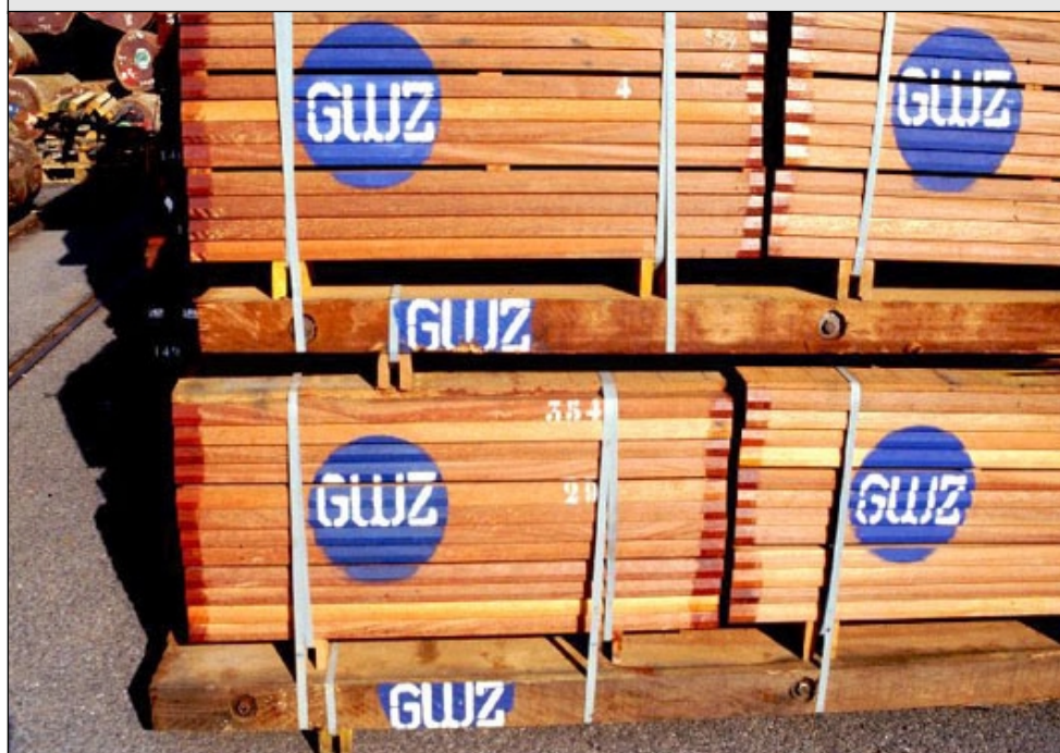
Wijma sawn timber in the Dutch port of Delfzijl.

Once Wijma's sawn timber arrives on the European market, it is impossible for the customer to verify the sustainability, or even legality, of Wijma timber. Logs from legal and illegal sources are easily mixed and could be processed together in Wijma's sawmills in Cameroon or in the Netherlands.