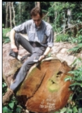
Researcher with a GPS receiver recording geographic co-ordinates of a log cut illegally by Wijma in the large log pond in UFA 09-018. © Greenpeace / Verbelen. July 2002

UFA 09-018 is a 30.000 hectare logging concession that was allocated to the Italian-owned logging company Fipcam in 2002. Unlike ventes de coupe, UFA's are located in the permanent forest estate and a management plan is required to ensure that their exploitation is sustainable. Unfortunately, there are numerous cases in Cameroon where UFA's are logged illegally (either by the concession owner himself or – more commonly – by a third party) before such a management plan is established, making the sustainable management of the concession an even more complex undertaking.