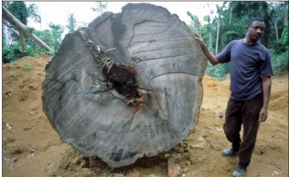
Bubinga log, illegally cut and abandoned by Wijma between the village of Nkolabouk and UFA 09-018. July 2002

Bubinga timber is an extremely valuable commercial hardwood. But these trees also have a high value for local communities, where they are used for medicinal purposes and have great spiritual importance. This commonly leads to social conflict between villagers and logging companies.